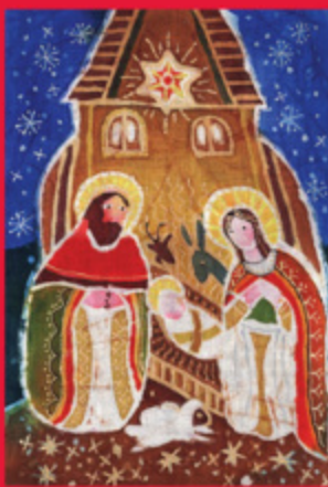
2008 Christmas Joy Offering

A Presbyterian tradition for almost seventy years, the Christmas Joy Offering is one of the four special offerings designated by the General Assembly of the Presbyterian Church (U.S.A.) to provide congregations direct ways of supporting specific causes that help those in need.